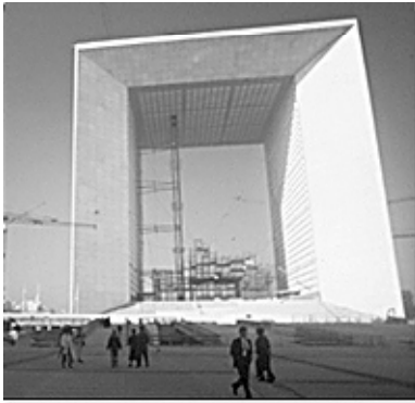
La Grande Arche